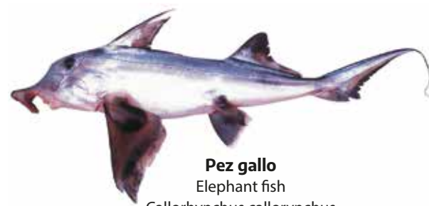
Pez gallo Elephant fish Callorhynchus callorhynchus