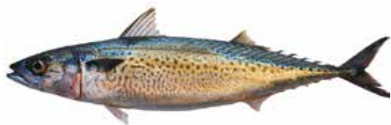
Caballa Chub mackerel Scomber colias