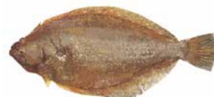
Lenguado Flounder Paralichthys patagonicus