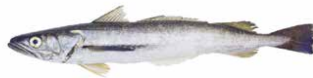
Merluza común Argentine hake Merluccius hubbsi