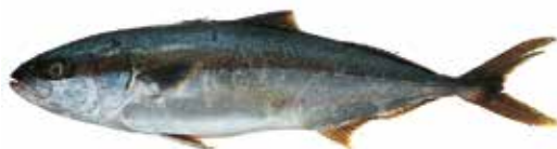
Pez limón Yellowtail amberjack Seriola lalandei