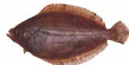
Lenguado Flounder Xystreurys rasile