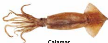
Calamar Argentine shortfin squid Illex argentinus