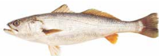
Pescadilla de red Stripped weakfish Cynoscion guatucupa