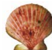
Vieira tehuelche Tehuelche scallop Aequipecten tehuelchus