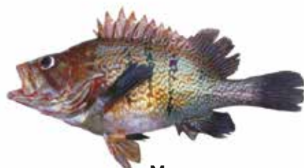
Mero Argentine seabass Acanthistius patachonicus