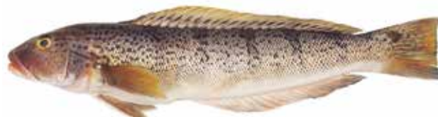
Salmón de mar Brazilian sandperch Pseudoperca semifasciata