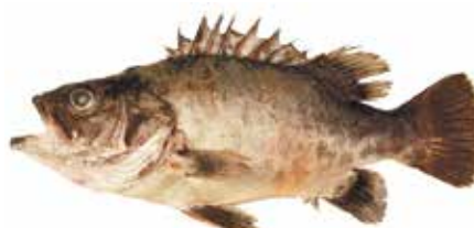
Chernia Wreckfish Polyprion americanus