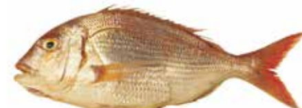
Besugo Red porgy Pagrus pagrus