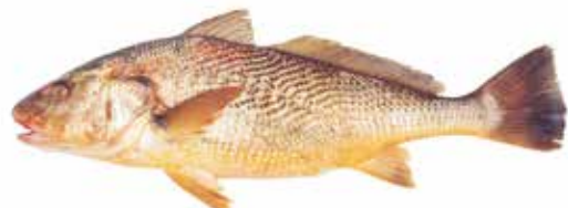
Corvina rubia Whitemouth croaker Micropogonias furnieri