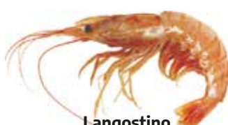
Langostino Argentine red shrimp Pleoticus muelleri