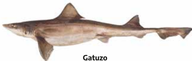
Gatuzo Narrownose smoothhound shark Mustelus schmitti