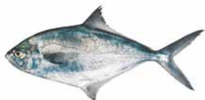
Palometa pintada Parona leatherjack Parona signata